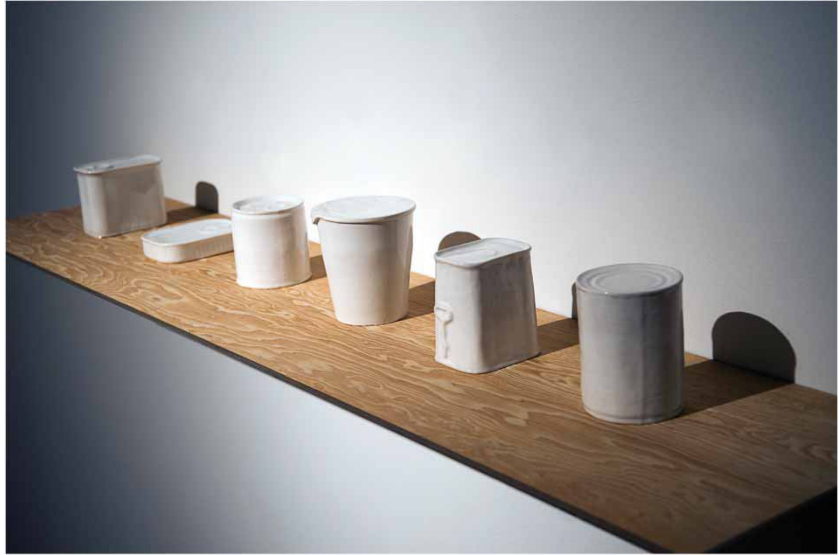
Provisions, Post-War (Pacific Asia and US) , 2007–2010, vitreous china, wood, 10.16 x 153.6 x 25.6 cm, detail of installation view, Genteel , 2010, photo: Lynne Yamamoto

bricolage . Genteel (2010) was first exhibited at the Oresman Gallery at Smith College in Northampton, Massachusetts. The title refers to nineteenth-century Western precepts of gentility and to the elevated status that the trappings of polite society conferred, once transferred to Hawai‘i by New England missionaries. Genteel is organized around three thematic components: Provisions, Post-War (Pacific Asia and US) , Grandfather’s Shed (Lana‘i City, Island of Lana‘i) , and Insect Immigrants, after Zimmerman, 1948 (Hawai‘i) .