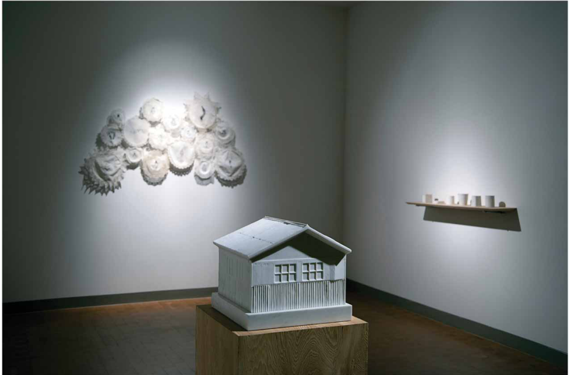
Genteel , installation view, 2010, mixed media, dimensions variable, Oresman Gallery, Smith College, Northampton, Massachusetts, photo: Lynne Yamamoto

Yamamoto's working and exhibition methods are organically inter-related, featuring the selective reconfiguration of existing pieces and the crafting of new works, all of which are assembled in relation to a particular site – applying a mix-and-match-like process the artist compares to