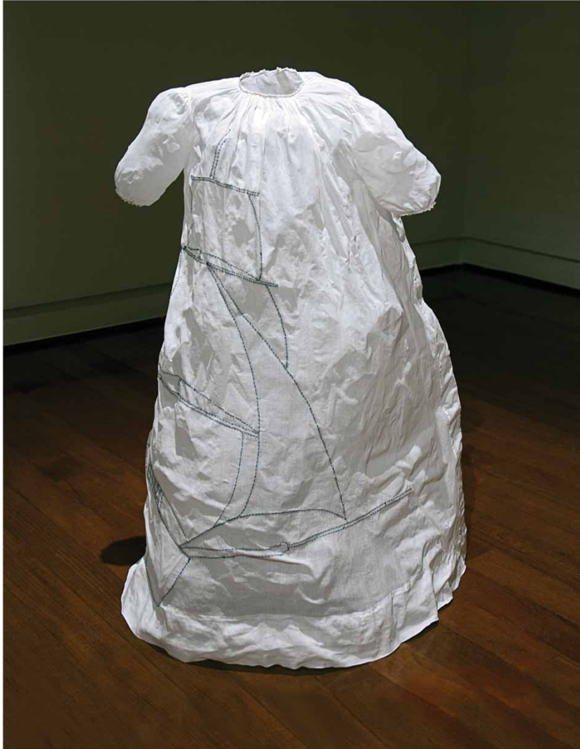
Sweating Bone China , detail, 2009, hand embroidery on found christening dress, 76.2 x 40.6 x 35.5 cm, The Contemporary Museum, Honolulu, Hawai'i, photo: Lucretia Knapp

carried the Lymans – who were among the first missionary families to arrive in Hilo, Hawai'i – to the island where the artist's mother was born. As a founding symbol of the missionary presence, the vessel provides a harbinger of the far-reaching changes brought about through Protestant evangelization, including the quasi-colonial social milieu that greeted arriving Japanese contract labourers during the late nineteenth and early twentieth centuries.