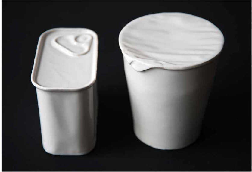
Provisions, Post-War (Pacific Asia and US) , 2007–2010, detail, vitreous china, 10.16 x 8.9 x 8.9 cm (Cup Noodle), 7.6 x 5 x 8.9 cm (SPAM)

Digitally carved from marble, this miniature monument acts as the artist's memorial to her grandfather's memory, as well as a tribute to the creativity of ordinary people who handily adapted local resources to their own needs. Significantly, the building's roof was fashioned from corrugated iron sheeting used in constructing the plantation workers' homes. The artist also recalls that the material was incorporated into the military Quonset huts, later converted to civilian use, which proliferated throughout the islands during the war years. These observations led Yamamoto to think about how this omnipresent industrial product has travelled the world since its 1820s British invention as a cheap, easily transported and assembled building material.